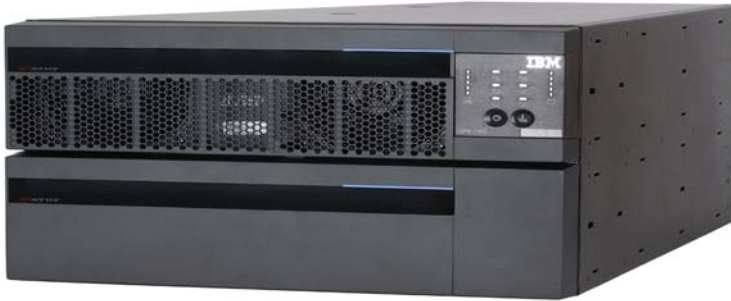
The IBM UPS10000XHV